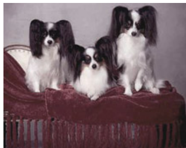
(Left to right) Nouveau Light Up The Sky (Rosie) with her two children Am Ch Nouveau Less Is More (Mouse) and right Am Ch Nouveau Texas Lady (Lady) (Lady)

FYI Twelve month old Mouse is the sire of Marichin's first bred-by papillon Elena who won the five point major and championship at the 2013 Tulsa Specialty.