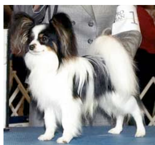
CH Oscar De La Hoya (Oscar) (pictured right)