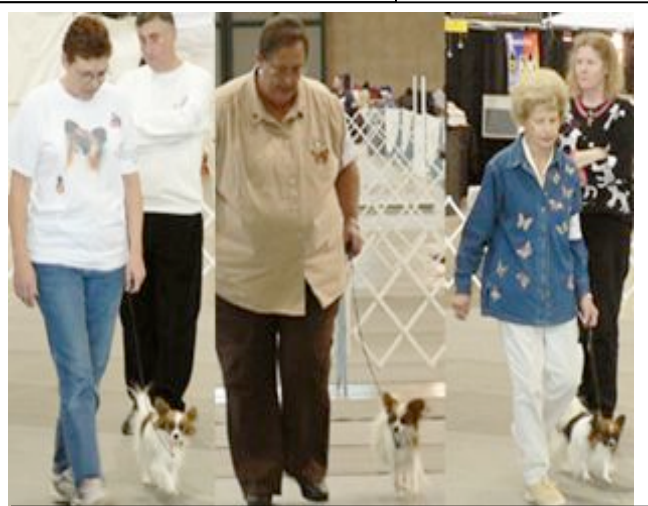
Performance looking good