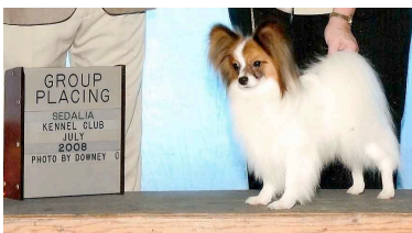
CH Marrics Keep on Truckin' (Kenworth) wins a Group 4 at Sedalia, MO.

The critical age for socializing your puppy is between 7 to 12 weeks of age