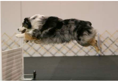
Nisroc is AKC/ASCA CH Shamans Heaven Sent to TJ-ROC, CGC, RN, RA, RE, AKC/ASCA CD, Delta Society Therapy Certified