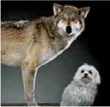
Less than 14000 years separates the Maltese and its ancestor, the wolf.