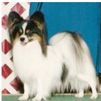
BISS CH Namaste Queen Bless Villa Incognito (Ricky J) #3 Papillon, #4