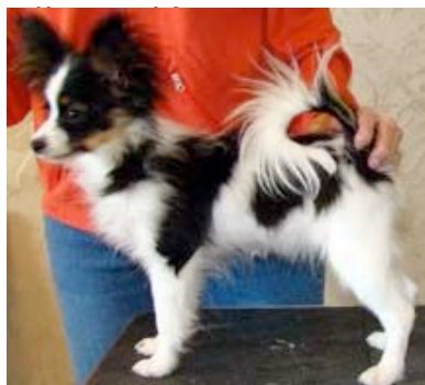
Zelicaon Lonestar Belle of the Ball (Ellie) - future